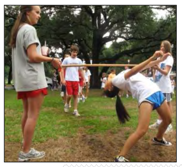
Let the games begin!