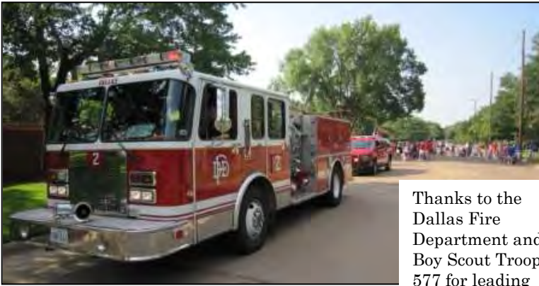
Thanks to the Dallas Fire Department and Boy Scout Troop 577 for leading our parade!