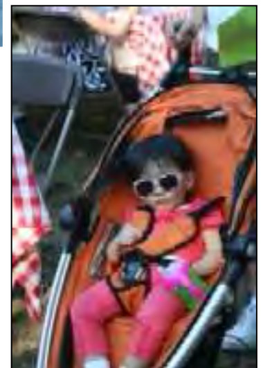
A good time was had by all...to the very end ☺