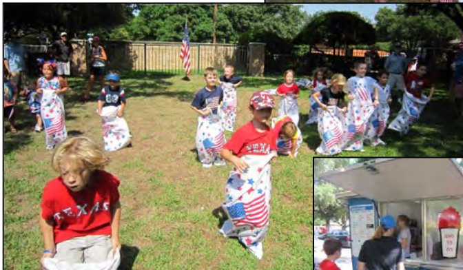
The sno-cone stand—back by popular demand, with even more flavors!