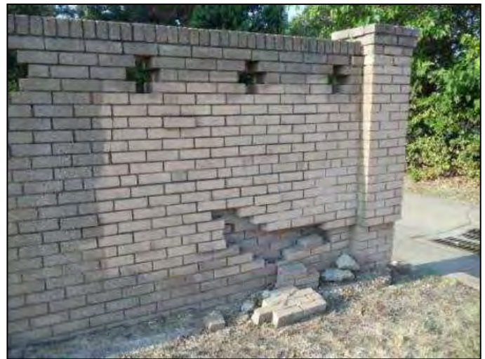
Further Forest Lane repair to be considered:

*Download a mail ballot application and find a sample ballot and a listing of Early Voting locations on www.dalcoelections.org . Find links to various analyses of the proposed amendments, go to the Secretary of State's website at www.sos.state.tx.us .