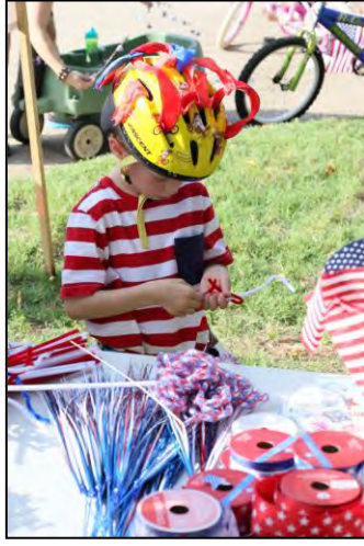
Many took advantage of the pre-parade "decoration station," a fun feature initiated just last year that is already improving with "age"!