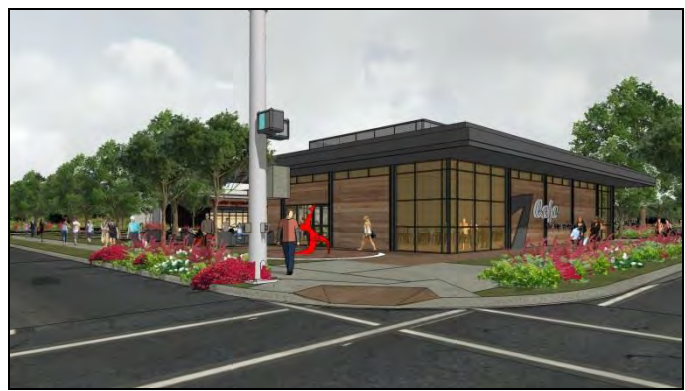
Current rendering of future street view at Inwood & Forest

For detailed information and renderings of the project, visit www.forestwoodFAQ.com.