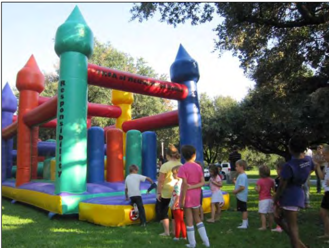
Kids enjoy the bounce house, compliments of Town North Y!