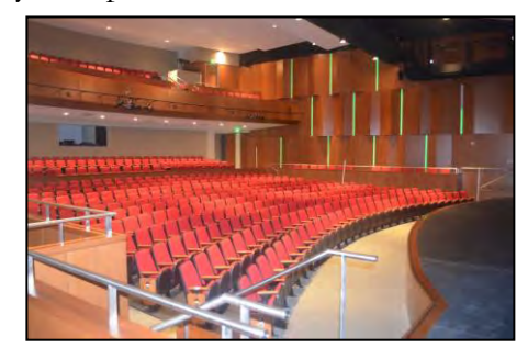
More area updates on the next page...

showcase her creative talents. and it is also a beautiful, graceful container for all the arts we offer."